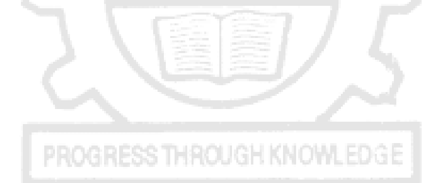
DIRECTOR Centre for Academic Courses Anna University, Chennai-600 025