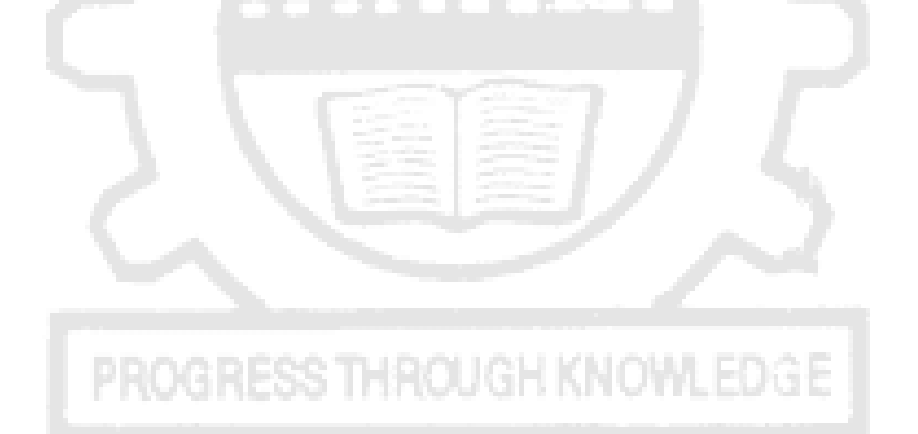
Centre for Academic Courses Anna University, Chennai-600 025